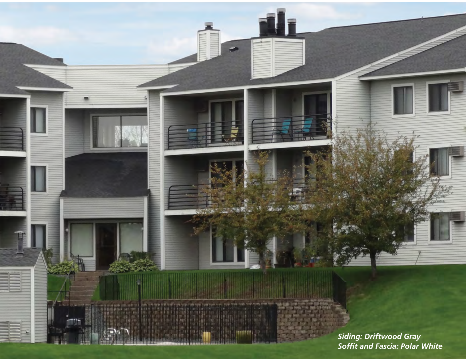
Siding: Driftwood Gray Soffit and Fascia: Polar White