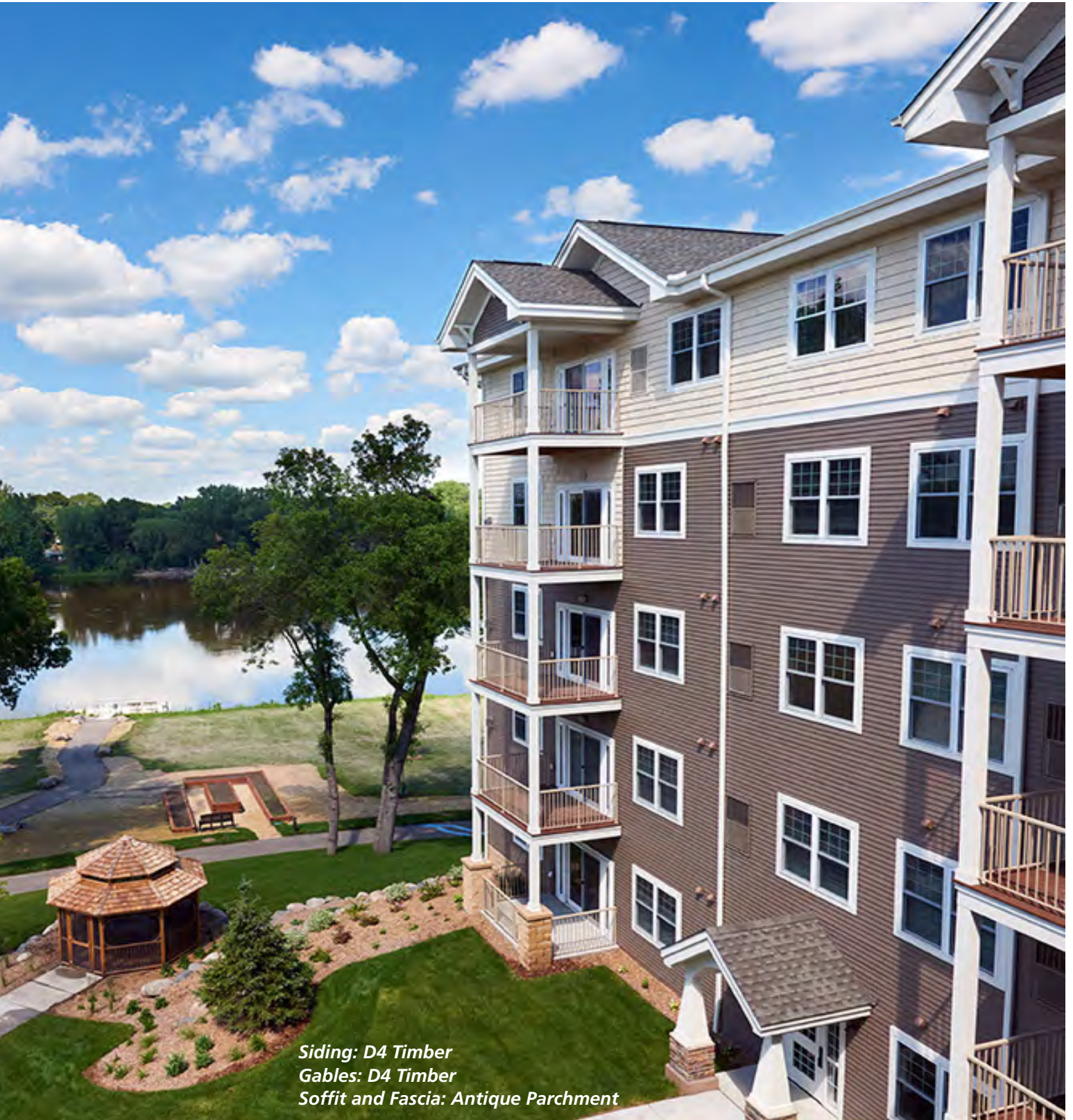
Siding: D4 Timber Gables: D4 Timber Soffit and Fascia: Antique Parchment