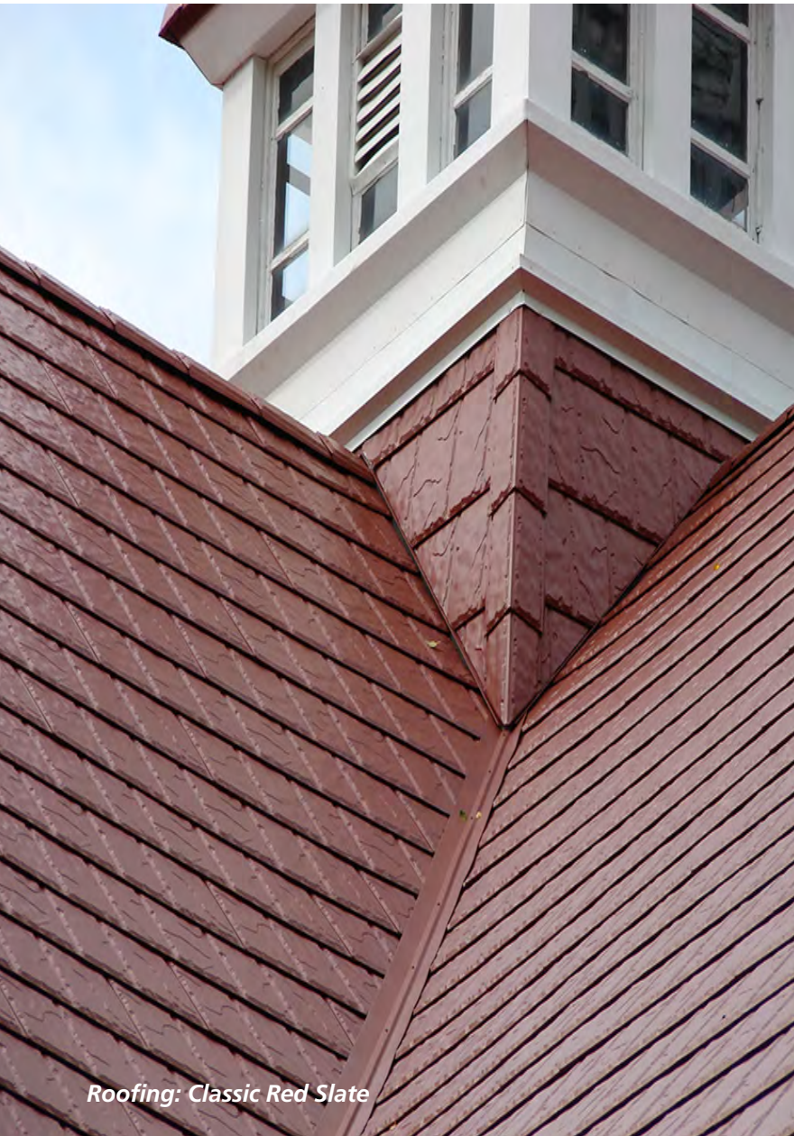
Roofing: Classic Red Slate